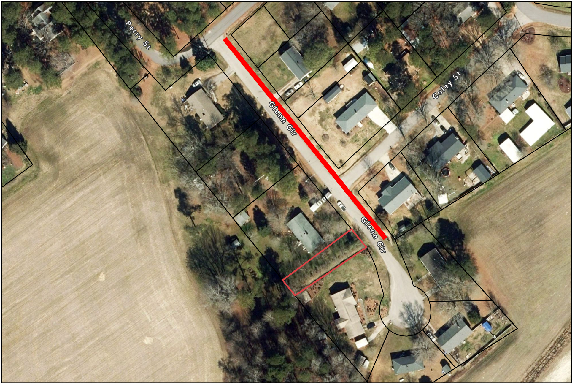
Exhibit C - Off-Site Stormwater Improvement Area