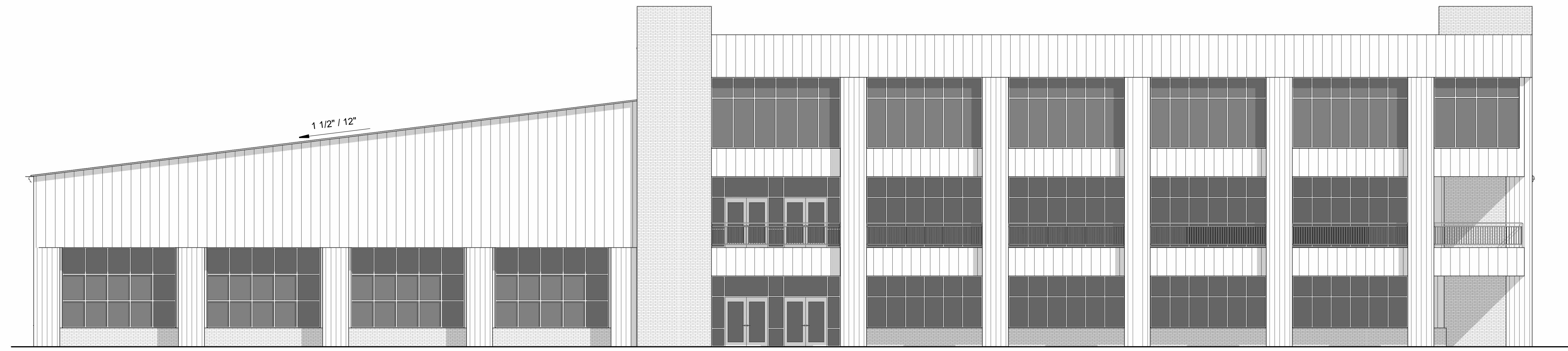
1 NEW - FRONT ELEVATION 1" = 10'-0"