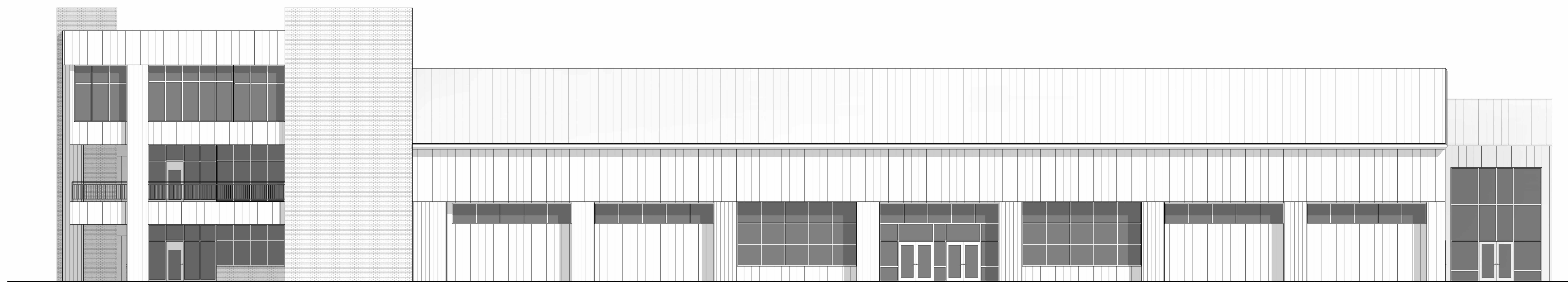
2 NEW - RIGHT ELEVATION 1" = 10'-0"